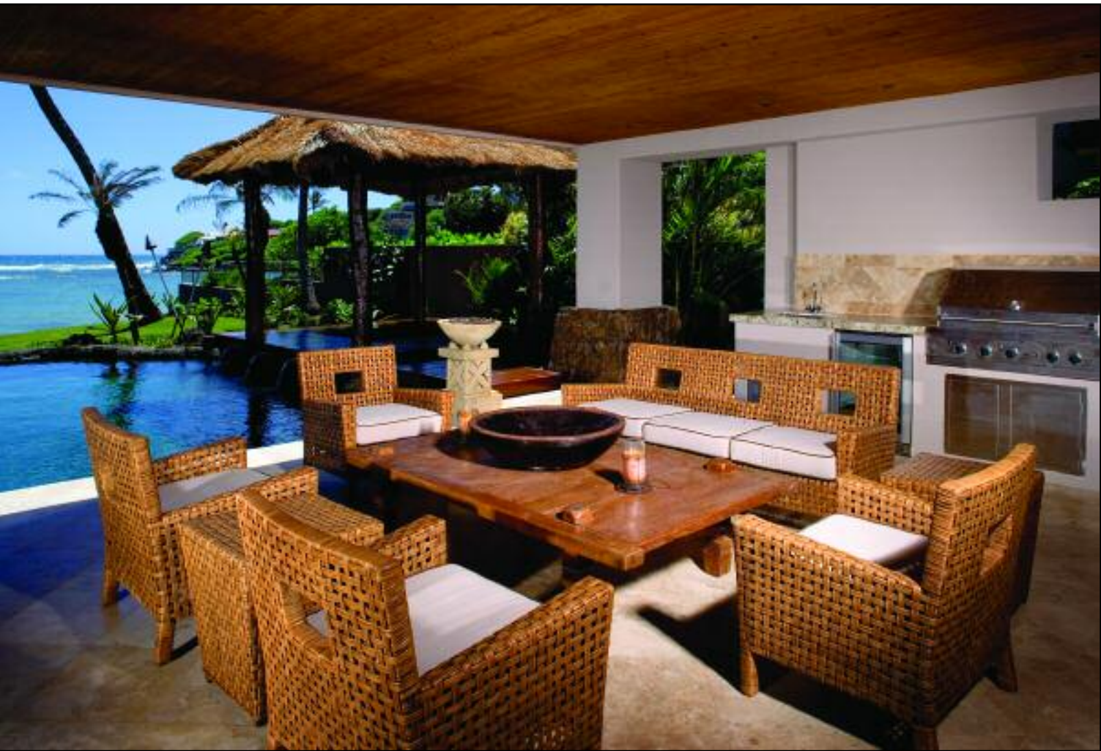
ABOVE: The 1,600 square foot covered lānai offers a relaxed sitting or area for dining with two outdoor lava rock showers and a gas grill.