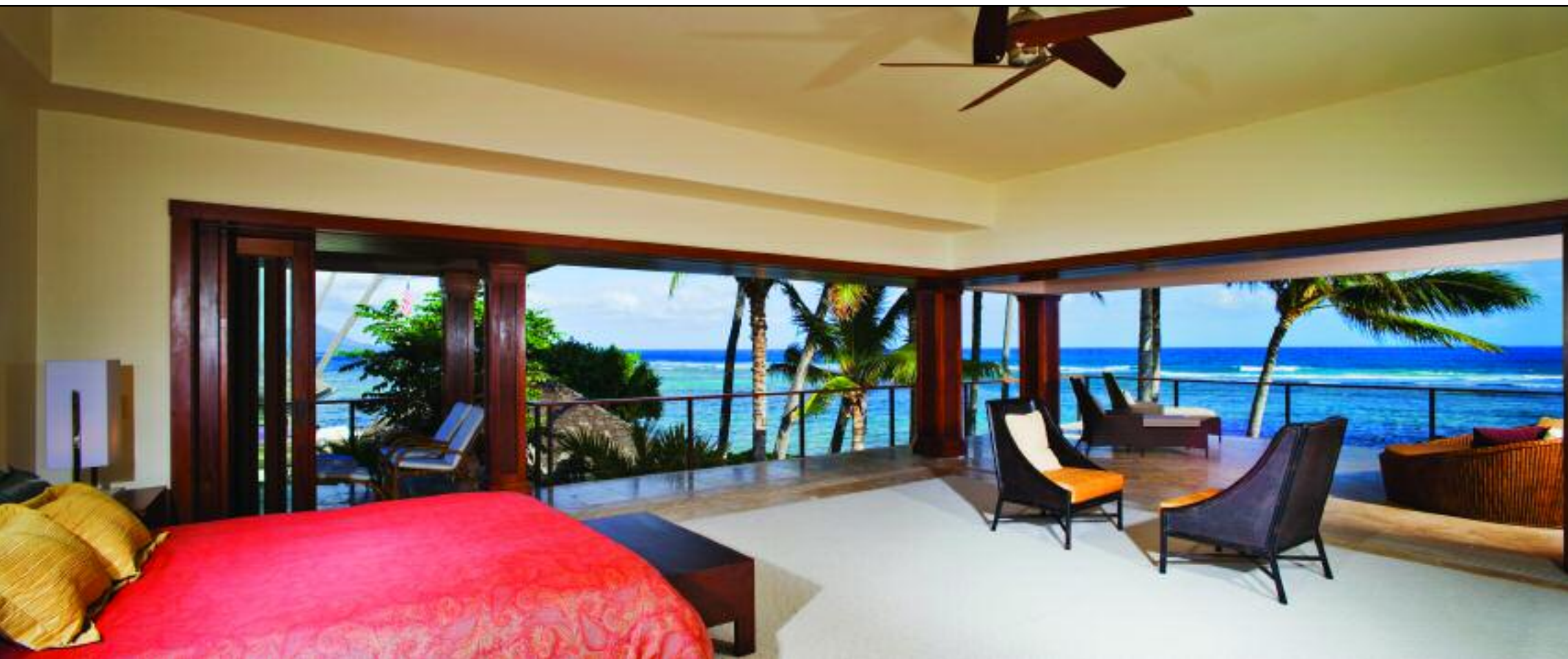
LEFT: The second floor, is dominated by the grand master bedroom suite. With 1,800 square feet of interior and 860 square feet of lānai, the suite has the feel of a sunlit penthouse atop the bow of a yacht. “Disappearing corners” reveal views of Maunaloa Bay.