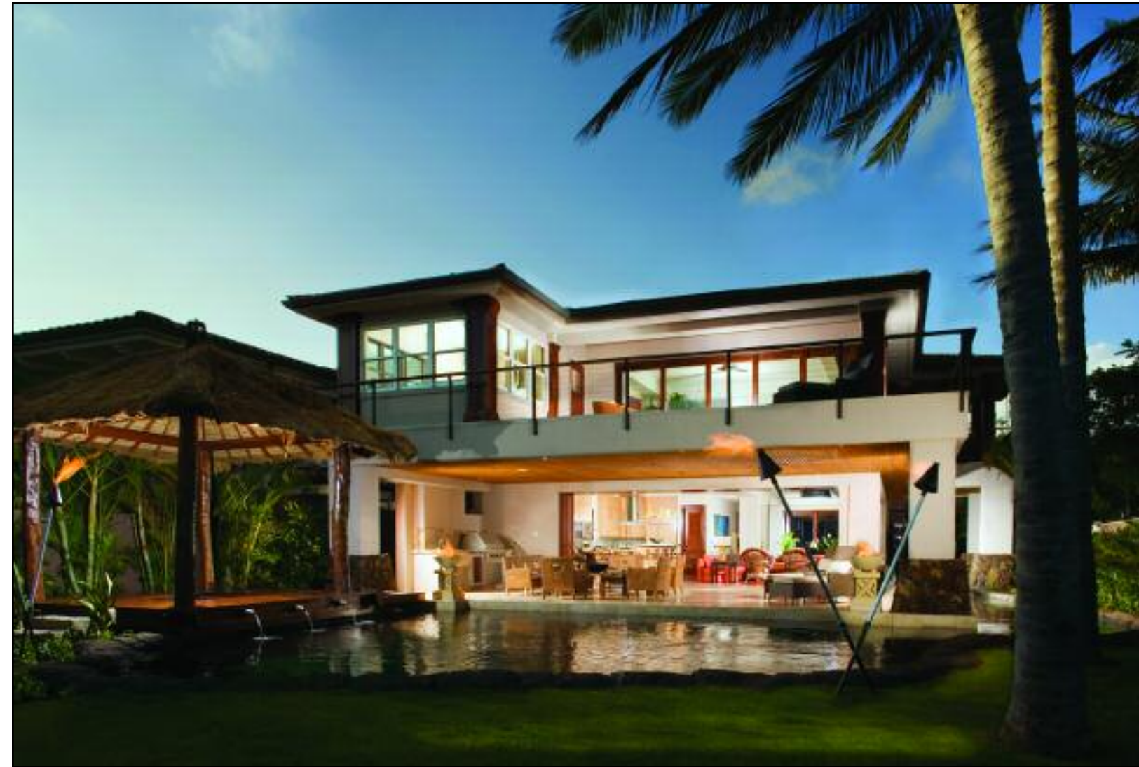
"It takes too much work and money to bring all the different elements of interior and exterior together on your own," says Eovino, "especially in Hawai'i where everything has to be shipped in. We have done all the leg work for the buyer." ABOVE: With tiki torches lit the evening ambiance is set for this ocean front property.

Double-wide stairs ascend to the second floor, which is dominated by the grand master bedroom suite. With 1,800 square feet of interior and 860 square feet of lānai, the suite has the feel of a sunlit penthouse atop the bow of a yacht. "Disappearing corners" reveal views of Maunalua Bay, complemented by the graceful arch of mature coco palms bending in