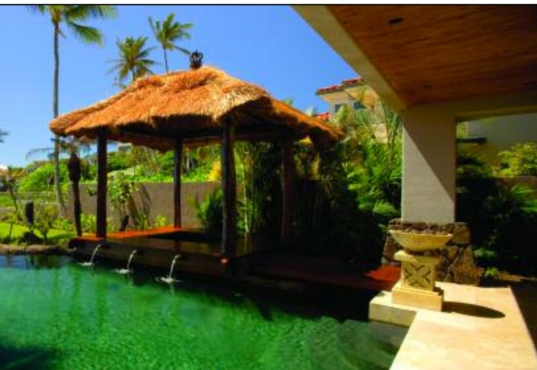
LEFT: A Balinese kubuku (cabana) with its stone bottom Jacuzzi offers shade from the sun and flawless views of Maunalua Bay, from Black Point to Koko Head. The hand-stitched thatched roof of the kabuku is supported by columns of native Hawaiian ohia lehua wood.