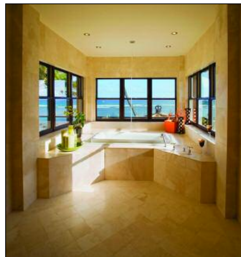
BELOW: Orchids and fragrant candles decorate the edges of the large bath.