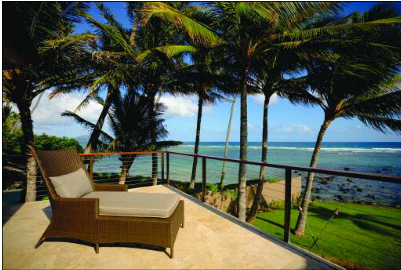
ABOVE: Eovino's Kahala house is perched at the edge of the sea, and the constant sunshine and cooling trade winds are a great part of its appeal. Eovino selected yacht wire instead of metal bars on the second floor lānai because it offered unobstructed views of the ocean and is more resistant to the harsh island elements.