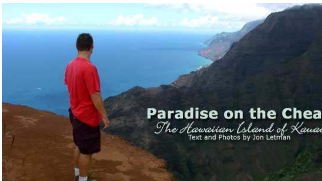
A hiker stops on the Nualolo Cliff Trail to view the Na Pali Coast b

Thumb through the glossy pages of Condé Nast Traveler magazine and the Hawaiian island of Kaua'i appears to be a rather upscale destination. Indeed, this island has many of the high-end corporate-owned hotels one expects to find in Hawai'i. There is no shortage of well-heeled tourists padding around the marble foyer of the Prince Hotel in Tommy Bahama-brand silk resort wear.