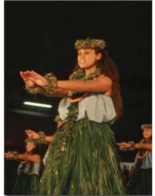
Current Events, Hawaii's Big Isl